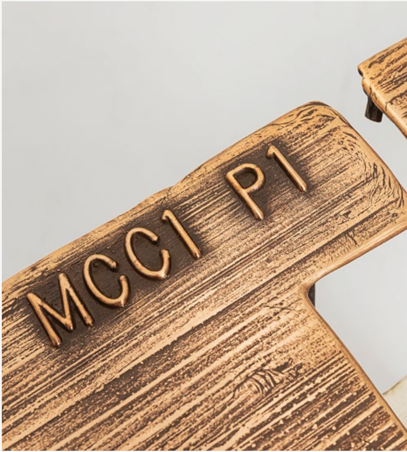
MARTIN LAFORET MCC1 , 2019 CONCRETE, BRONZE 90 X 151 X 29 CM 35 3/8 X 59 1/2 X 11 3/8 IN PROTOTYPE, EDITION OF 8 PLUS 4 AP