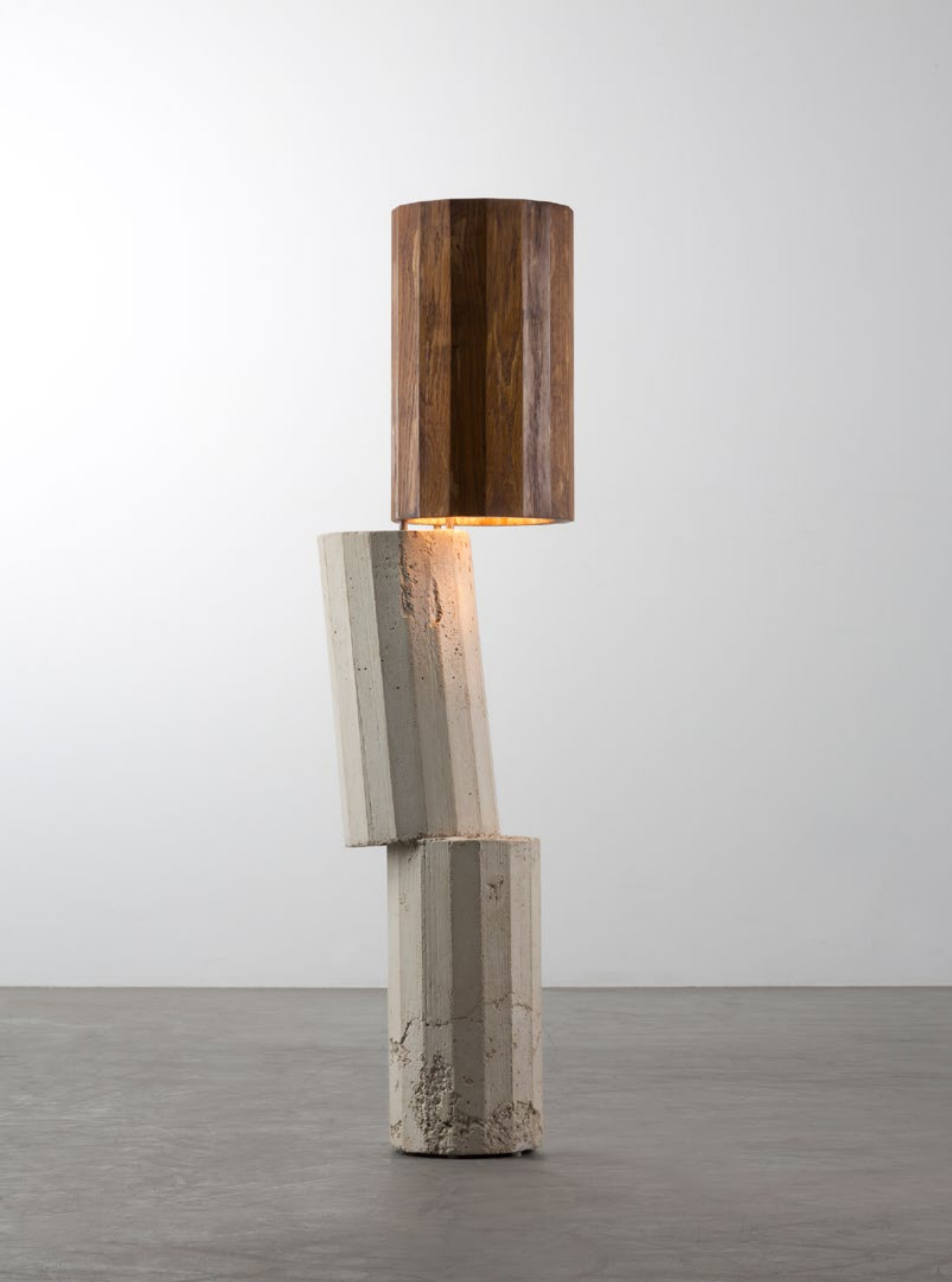
MARTIN LAFORET MCL2 C , 2019 OAK WOOD, CONCRETE, LIGHT FITTINGS 119 X 33 X 23.5 CM 46 7/8 X 13 X 9 1/4 IN EDITION 8 PLUS 4 AP