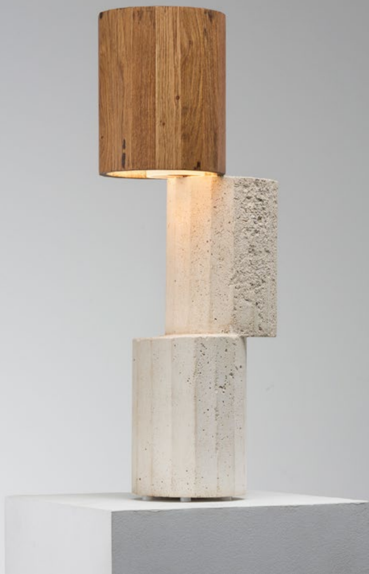
MARTIN LAFORET MCL2 D , 2019 OAK WOOD, CONCRETE, LIGHT FITTINGS 58 X 24 X 15 CM 22 7/8 X 9 1/2 X 5 7/8 IN EDITION OF 8 PLUS 4 AP