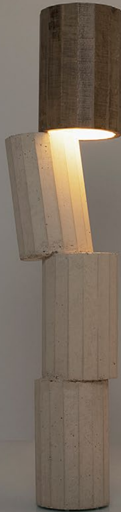
MARTIN LAFORET MCL2 B , 2019 OAK WOOD, CONCRETE, LIGHT FITTINGS 159.5 X 38 X 27 CM 62 3/4 X 15 X 10 5/8 IN EDITION OF 8 PLUS 4 AP