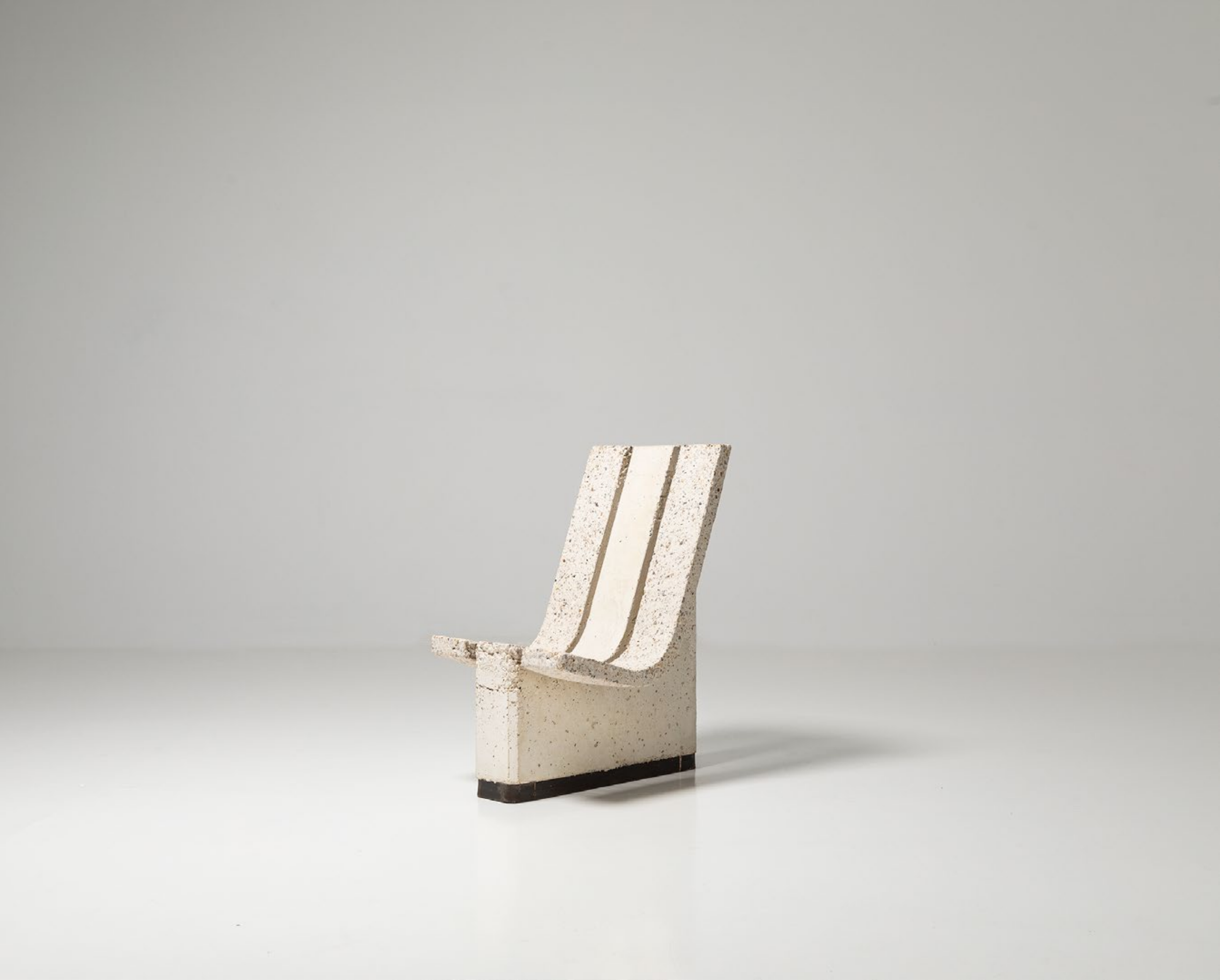
MARTIN LAFORET V1LC3WHITE , 2022 CONCRETE 72 X 39 X 56 CM 36 1/4 X 16 7/8 X 29 1/2 IN UNIQUE EDITION