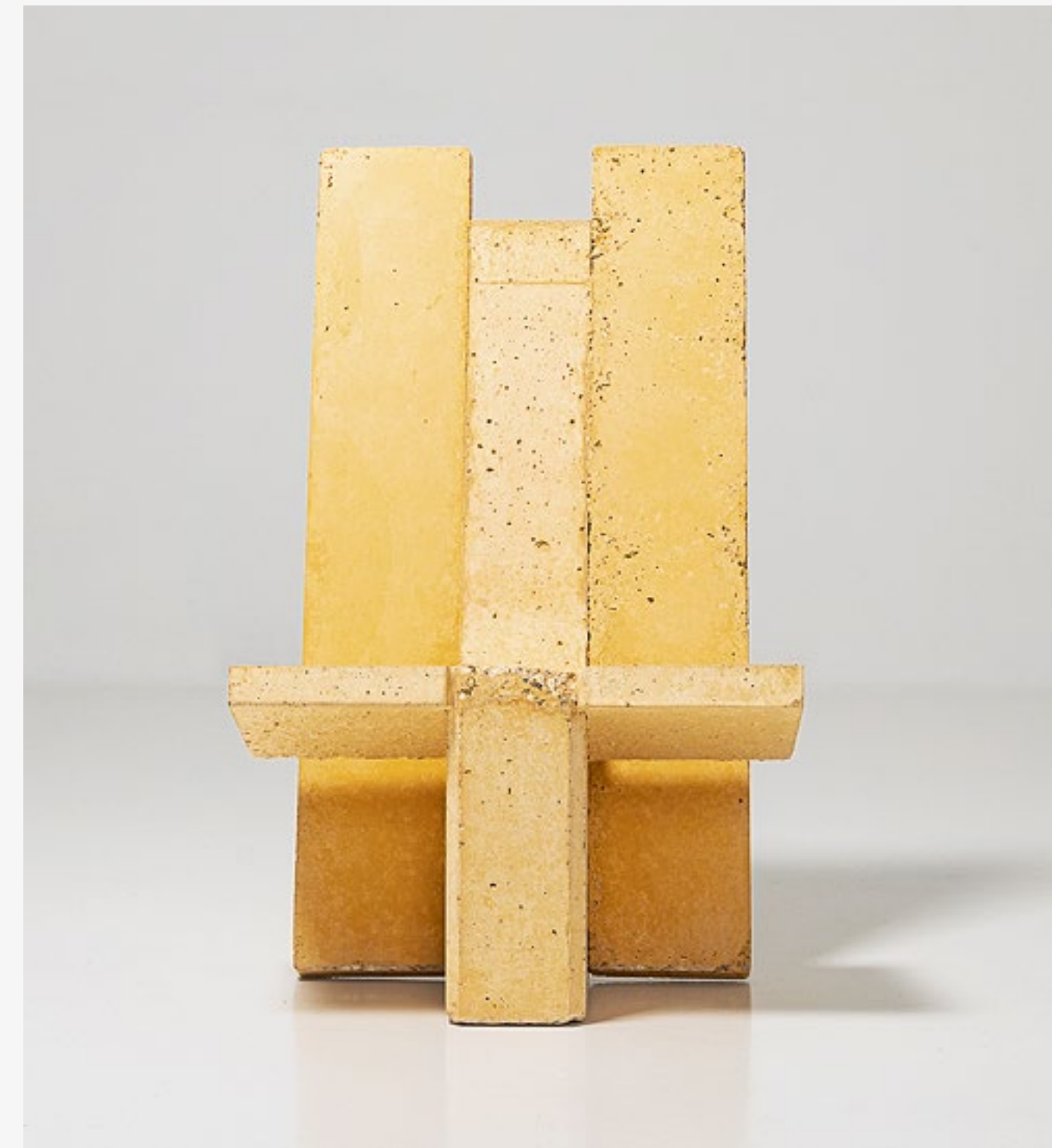
MARTIN LAFORET V1LC2YELLOW , 2022 CONCRETE 80 X 57 X 51 CM 36 1/4 X 16 7/8 X 29 1/2 IN UNIQUE EDITION