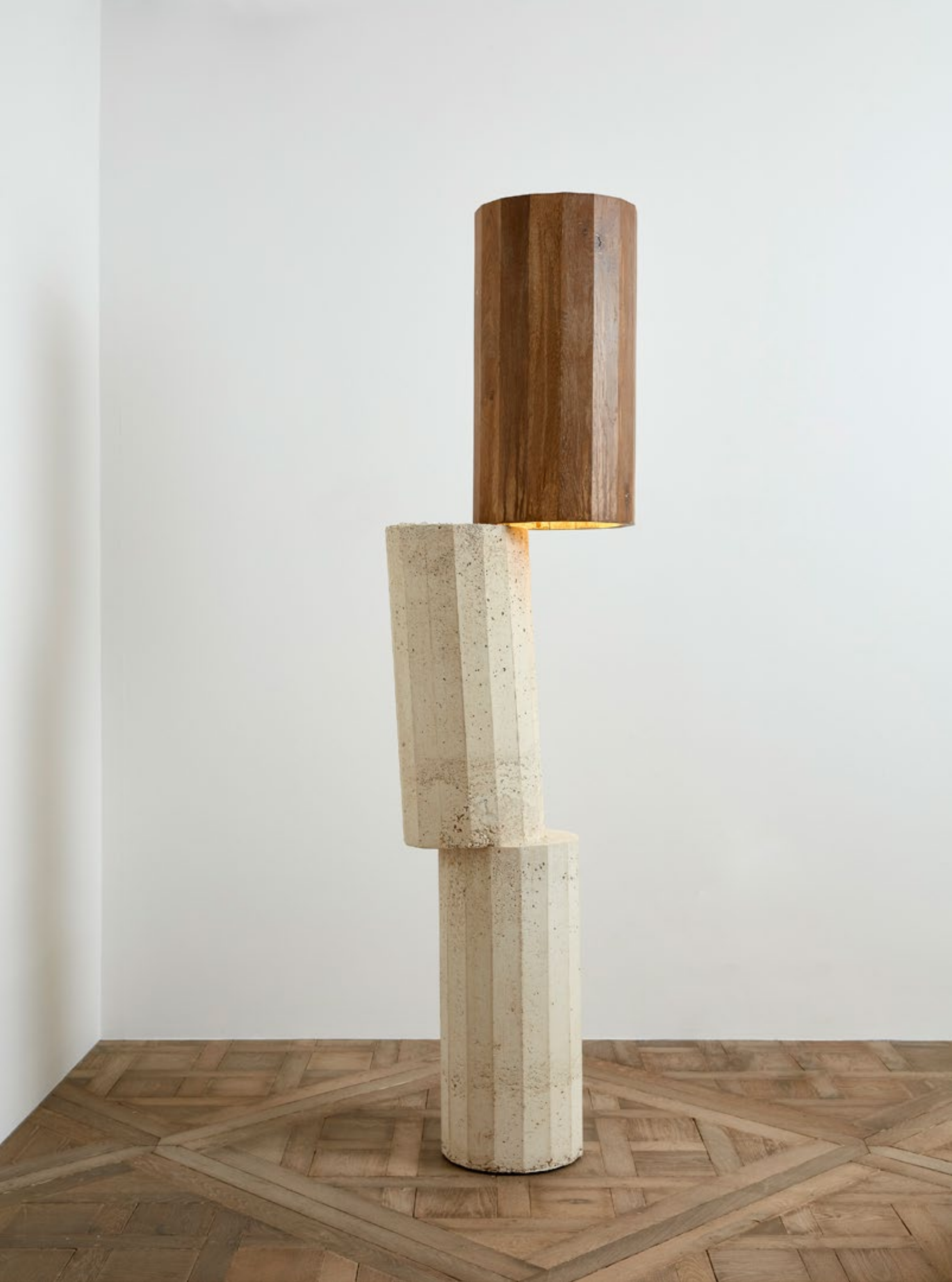
MARTIN LAFORET MCL2 A , 2019 OAK WOOD, CONCRETE, LIGHT FITTINGS 201 X 50 X 34.5 CM 79 1/8 X 19 3/4 X 13 5/8 IN EDITION OF 8 PLUS 4 AP