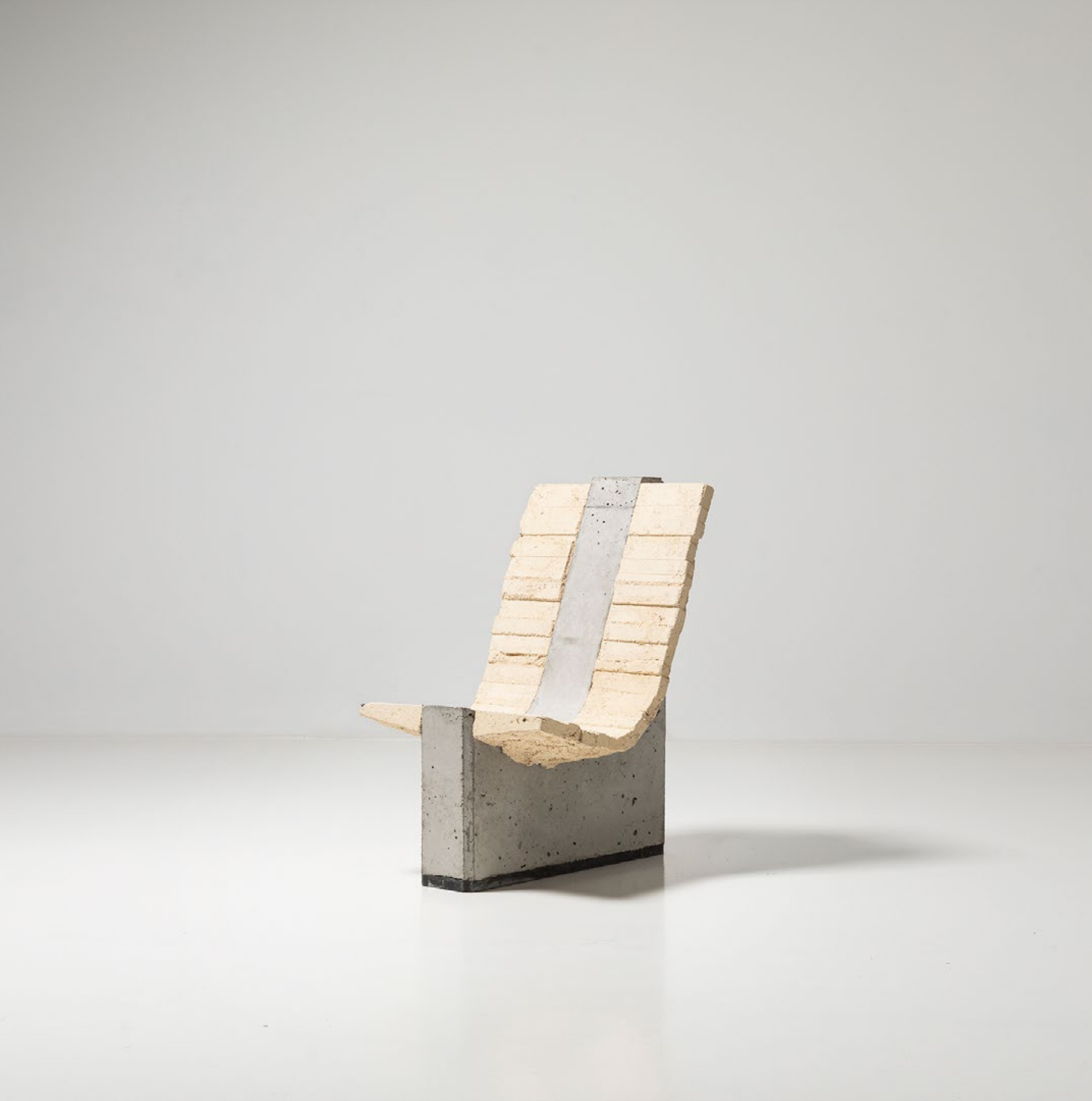
MARTIN LAFORET V1LC5WHITEGREY , 2022 CONCRETE 72 X 42 X 57 CM 28 3/8 X 16 1/2 X 22 1/2 IN UNIQUE EDITION