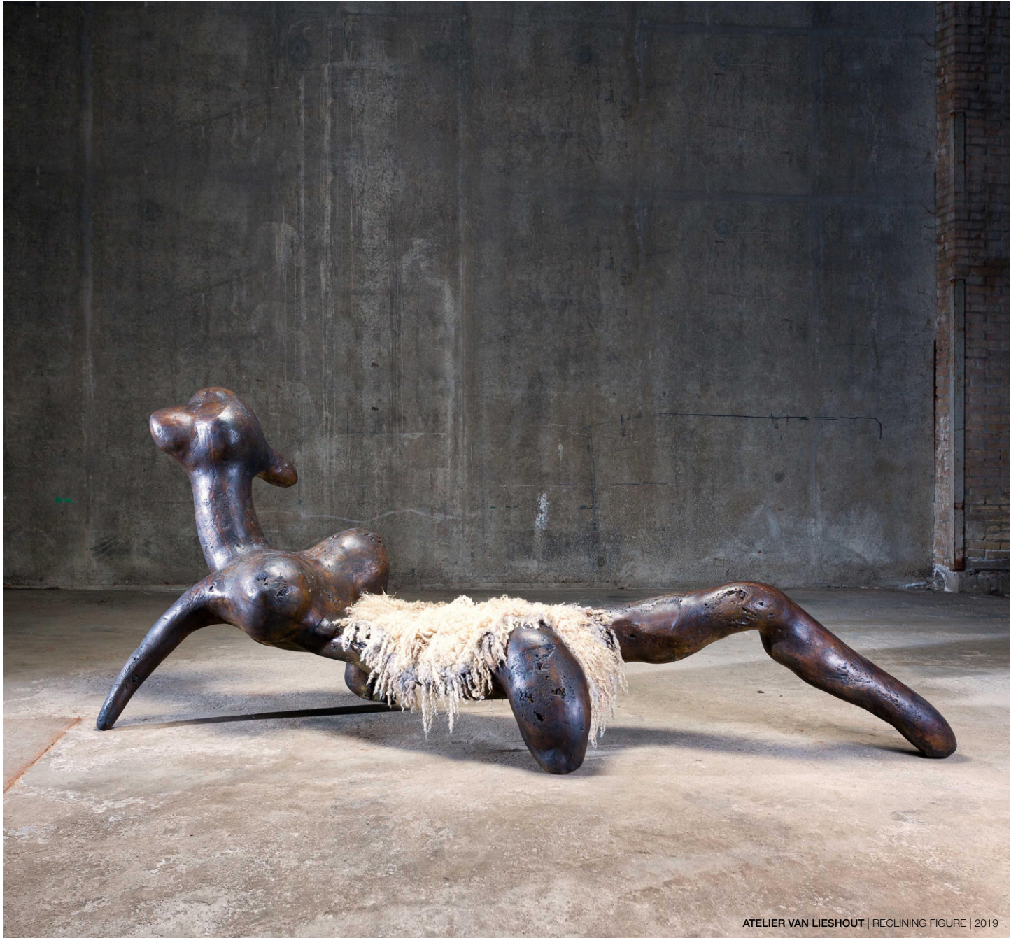
ATELIER VAN LIESHOUT | RECLINING FIGURE | 2019

NEW YORK | CARPENTERS WORKSHOP GALLERY 693 FIFTH AVENUE, NEW YORK