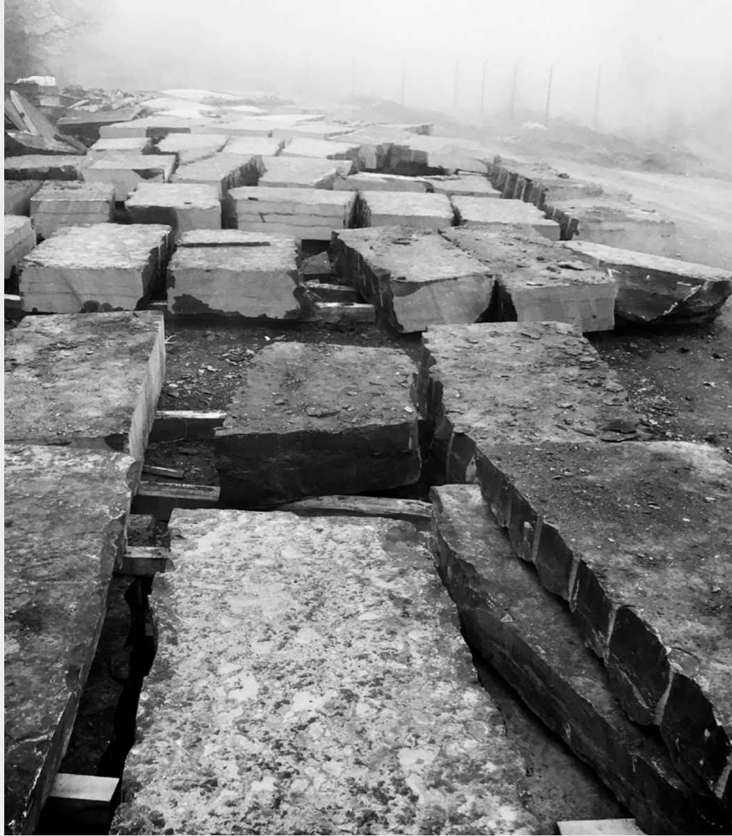
Raw, untreated Belgian Black marble is grey in appearance, before undergoing the polishing and refinement process. Situated here at ground level, just outside of the deep underground quarries from which it is painstakingly excavated, only the most immaculate deposits are retrieved before the illustrious stone goes up for auction.