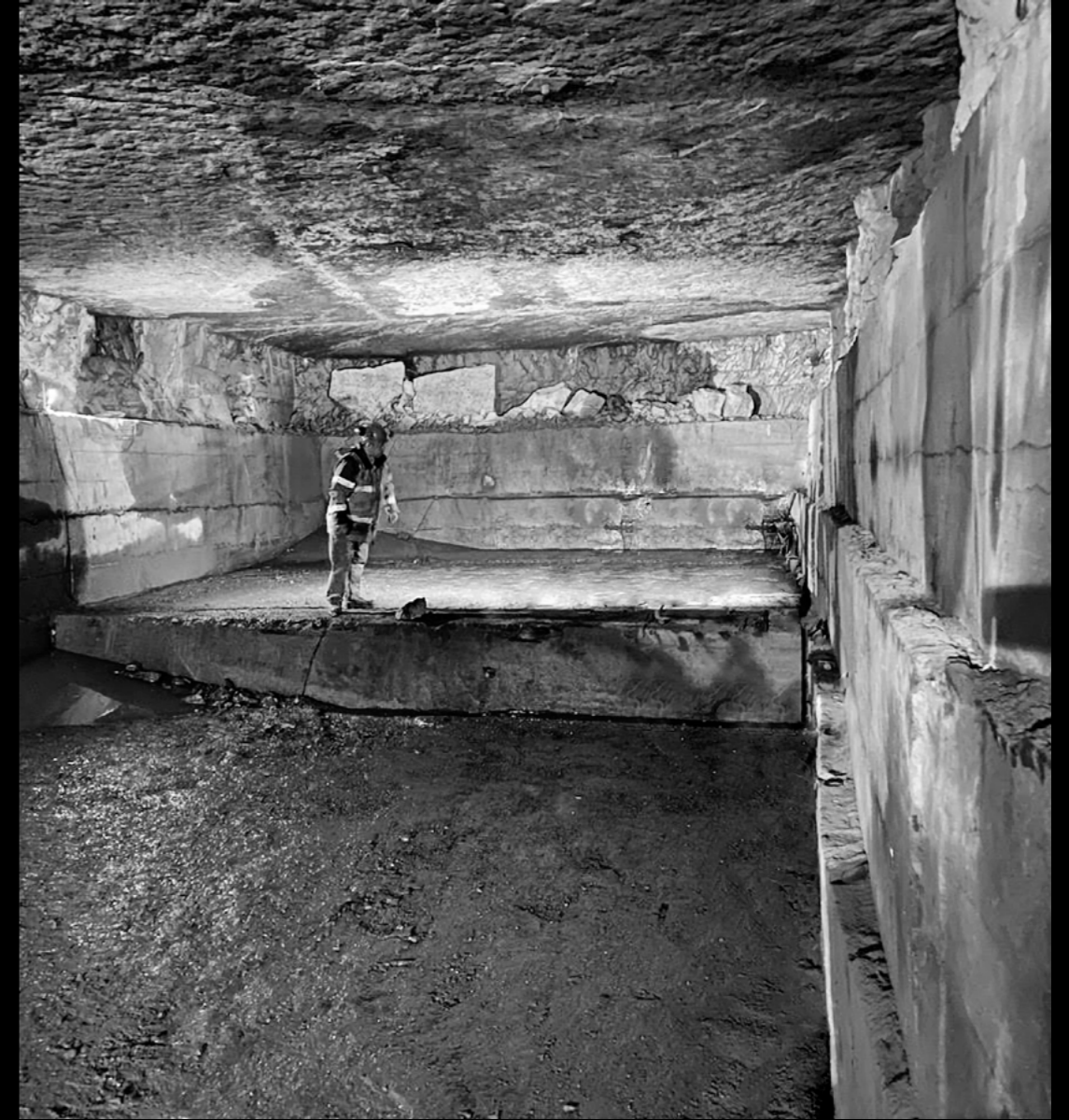
'Noir de Mazy' is excavated systematically from the only two known locations where the stone is accessible on the globe. Expert miners operate highly elaborate machinery to locate the purest sources of Belgian Black marble, employing complex mathematical equations to calculate the optimum angles for extraction.